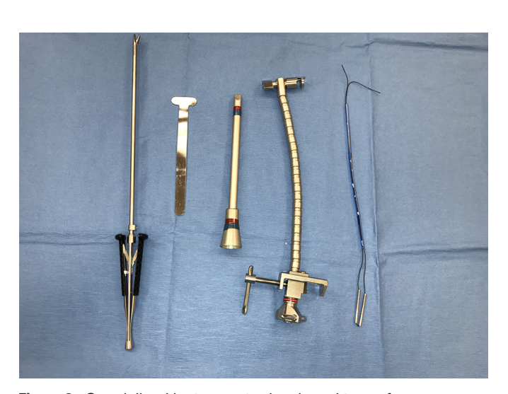
Figure 2. Specialized instruments developed to perform surgery through the right transverse axillary incision. Left to right: endoscopic needle holder, modified lung retractor, knot pusher, self-retaining retractor, and aortic cross-clamp. (Color version of figure is available online.)

The heart is evaluated by transesophageal echocardiography by our team of pediatric cardiac anesthesiologists to confirm the absence of residual or new defects and to aid in deairing. Intercostal nerve block with bupivacaine is routinely performed before completion of the procedure, infiltrating ribs 3-5. A single chest tube and, if needed, pacing wires are placed through the initial incision. The skin is closed, with the residual scar between the anterior and the posterior axillary lines (Fig. 3). Patients are routinely extubated in