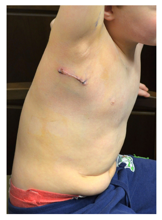
Figure 3. A 10-year-old congenital heart surgery patient 1 week postoperatively, with arm abducted to expose a healing right transverse axillary incision. (Color version of figure is available online.)