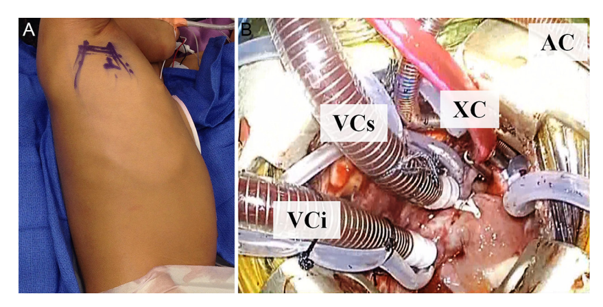
Figure 1. The right transverse axillary incision in a 5-year-old patient undergoing a subarterial ventricular septal defect repair. (A) Before the start of surgery, the incision line is marked between the anterior and the posterior axillary lines in the fourth intercostal space. (B) Surgeon's view after application of the cross-clamp (XC), demonstrating the central cannulation setup including direct aortic cannulation (AC), as well as bicaval cannulation with venous cannulae in the superior venae cava (VCs) and inferior vena cava (VCi). (Color version of figure is available online.)

mize exposure and aid in isolating the lung from the operative field. The patient is then heparinized with a dosage of 70-80 units/kg. Aortic and bicaval cannulation are performed centrally in a routine fashion (Fig. 1B). After commencing cardiopulmonary bypass, simple procedures such as an atrial septal defect (ASD) repair are routinely completed on a fibrillated heart utilizing ventricular pacing wires. For more complex procedures, the aorta is cross-clamped and cardioplegic arrest is undertaken using blood cardioplegia. Next, surgical repair of the congenital heart defect is performed, with the aid of a customized tray of retractors and endoscopic tools (Fig. 2) to optimize exposure and maneuver within the small space. At the conclusion of the intracardiac repair, the cross-clamp is removed and modified ultrafiltration is commenced before decannulation.